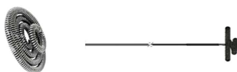
Cerebral aneurysm treatment device “Nautilus™”

Based on our mission of “KANEKA thinks ‘Wellness First’.”, we will realize a world where advanced medical care is accessible to everyone and where science contributes to the innovation of the global environment and our daily lives.